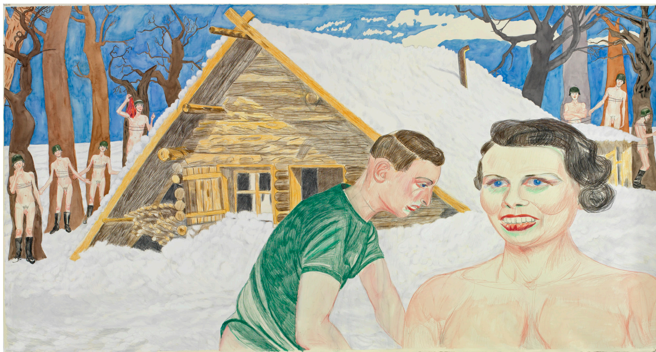
L'Éternel Retour 7/ Ma Mère et Georges B. (1943), colored pencil and watercolor on paper, 150 x 285 cm, 2001

在《皮格马利翁》的故事中，艺术家的欲望实质上指向自己的创造，是对自己天赋的崇拜。“现代艺术的历史可谓人类精神进步的范式……因为我们的文明即产生自人权的世俗人类学。主体如果获得自主权，那么他的艺术作品将是其最纯粹的见证、最珍贵的分泌物。没有任何东西能比这些人类天赋的产物更为珍贵……这些产物证明了自身的无限权利及无限自由。（让·克莱尔）”毕加索、弗洛伊德、培根等艺术家的所作所为不正说明了这一点，他们从绘画中找到混乱生活的支撑，或者说用绘画来克服他们的“否定性”。