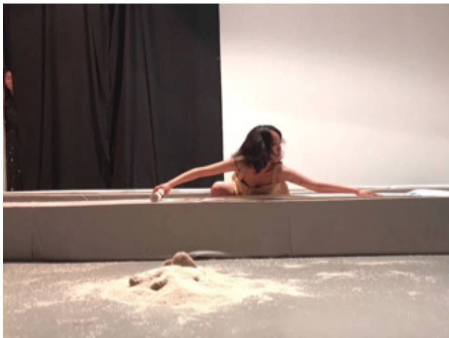
Chess Qizi 棋子, Performance at the Chinese European Art Center, Xiamen. 13th October 2018