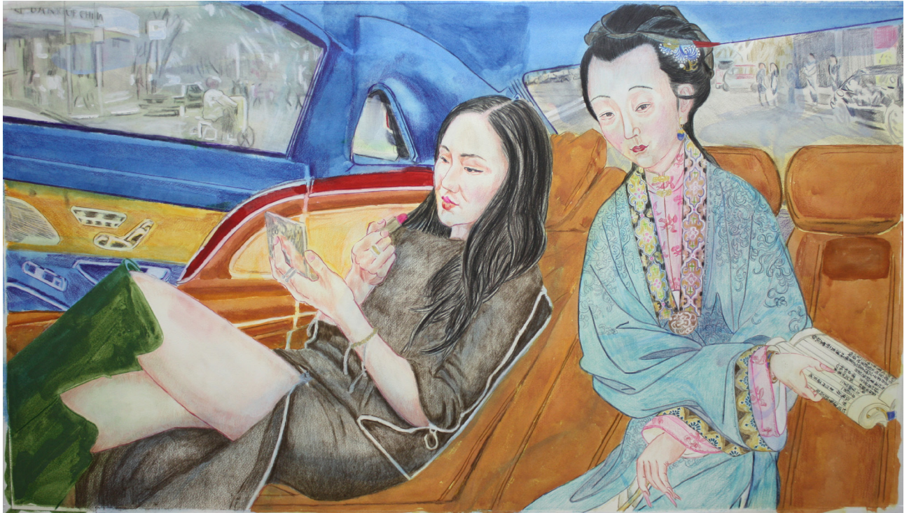
Mapping Beauty 7 , colored pencil and watercolor on paper, 56,5 x 101 cm, 2017. Private collection

The thoughts of Kierkegaard and Bataille have a great influence on Pedro. The joint point between these two philosophers is the criticism and reinterpretation of the negativity in Hegel's philosophy. Hegel's recognition of negativity is only a means of self-realization. God or the world, religious or the secular other, it will return the abandoned self to oneself, which actually eliminates one's own autonomy and independence. On the contrary, Kierkegaard believes that negativity is the most authentic experience of the individual's self-existence. It drives people to take action and make an alternative choice, that is, what Kierkegaard calls "leap", which is from the determination and the passion to form ourselves. It points to the internality or subjectivity of the individual.