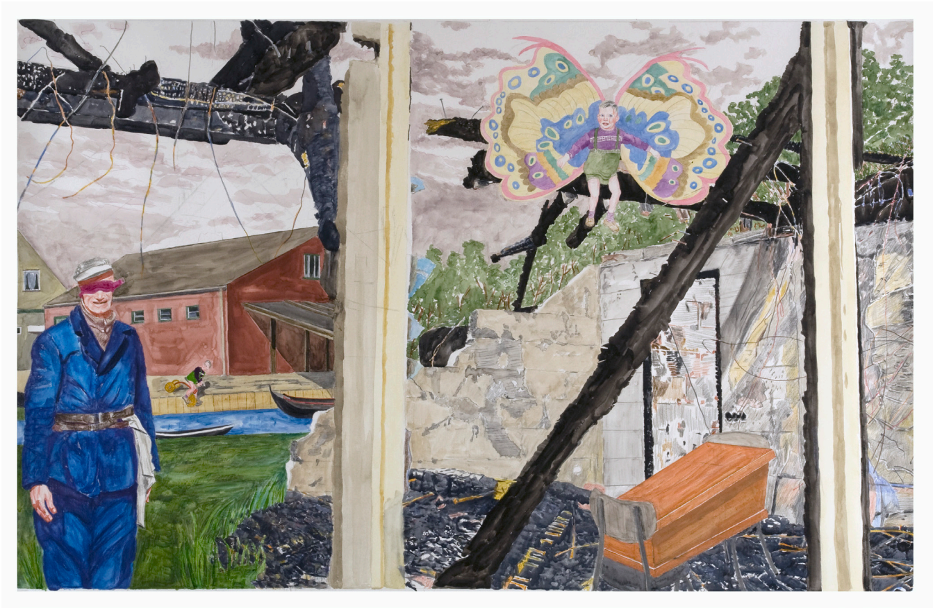
Burnt Home 6 , colored pencil and watercolor on paper, 125 x 190 cm, 2009