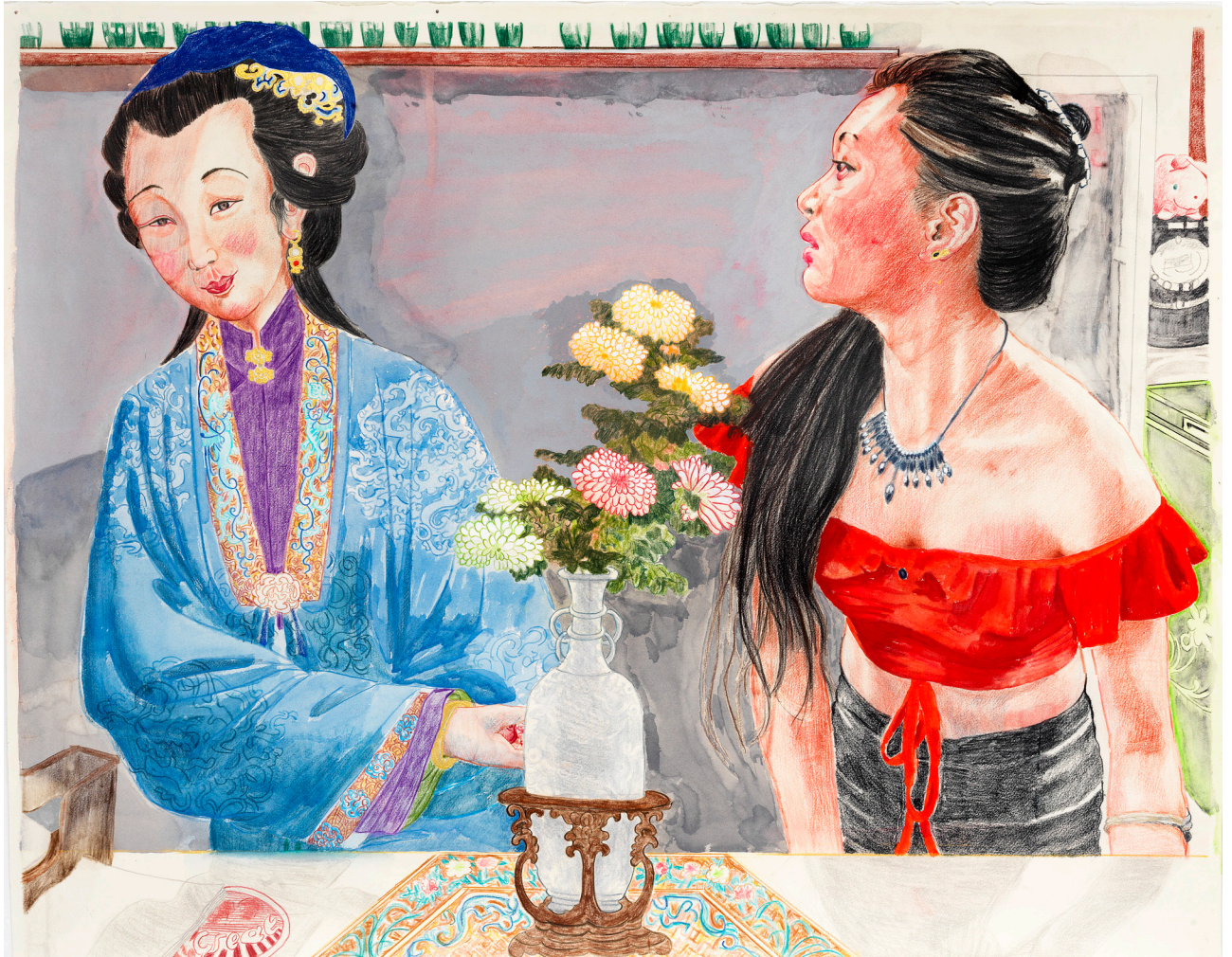
Mapping beauty 9, colored pencil and watercolor on paper; 75,8 x 95,5 cm, 2017