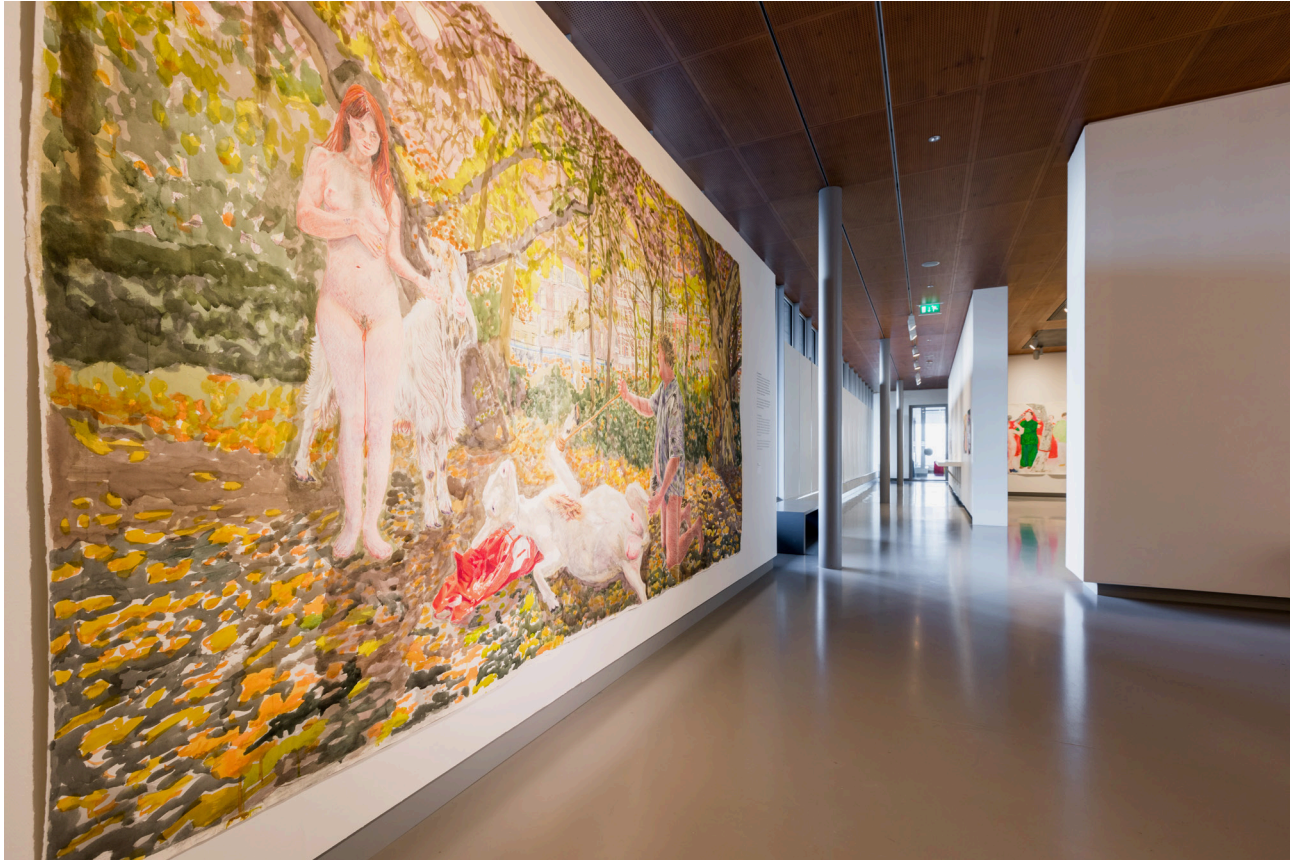
Overview Solo exhibition Gerrit Bennerprize, Fries Museum, Leeuwarden 2017 The Goatfucker