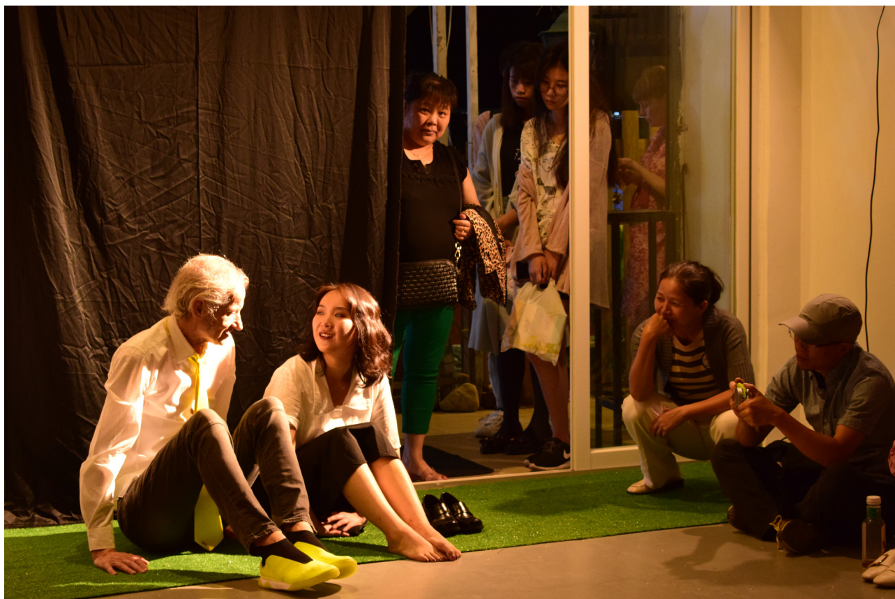
Chess Qizi 棋子, Performance at the Chinese European Art Center, Xiamen. 13th October 2018