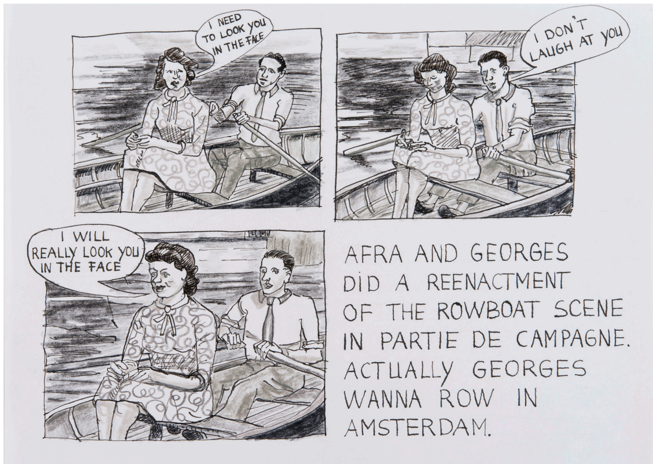
No Title, pen and colored pencil on paper, A4, 2008

is gone. When I am assailed by such whims, I am usually near my studio, because there I can withdraw as a draftsman to put pencil to paper in silence. In this place, I am open to the foolish ideas of which Bataille speaks. Do I as an artist have access to the extreme experiences of murder and eroticism?"