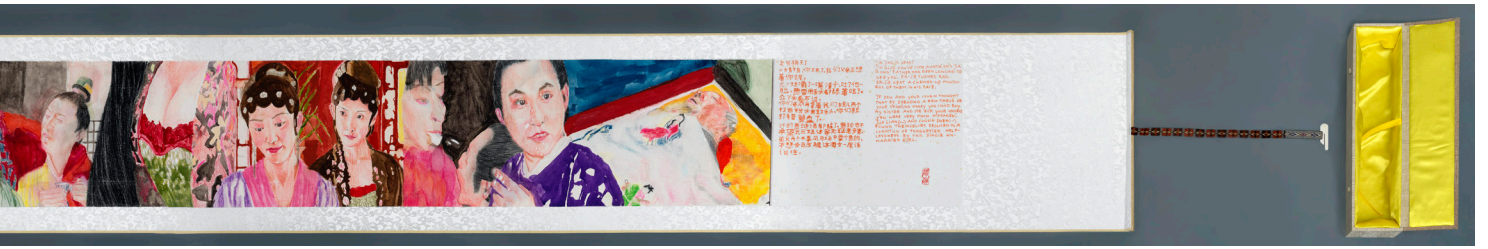
You Sanjie , colored pencil and watercolor on ricepaper mounted on a handscroll, 32 x 450 cm, 2017

如果说表演的第一部分是关于佩德罗所谓的“中国女孩”美好的灵魂的话，第二部分对《洛丽塔》的引用，以及第三部分女学生的暧昧态度中，似乎我们又看到了倩茜的身影。然而，这是佩德罗理解中的倩茜，倩茜已隐身于茫茫人海，真相不得而知。而对于他将一个真实的性侵犯故事改编为“欲望都市”的另类演绎，真的是为中国女权主义运动发声吗？当因为舆论监管，那些性骚扰的受害者被剥夺了发声的权利时，这样的改编是对她们的支持吗？